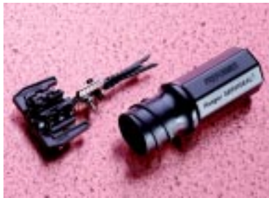
Vial and Cap

There are no loose parts. Each SERWISEAL Closure consists of a pre-filled vial, and a cap assembly with integral insertion ram and bonding connector.