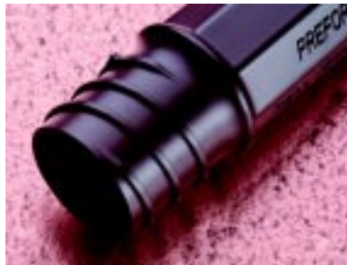
Cap Thread Locking Feature

The SERWISEAL Closures now have a locking feature on the threads of the vial which provides a clear indication that it is fully engaged and prevents reuse of the vial.