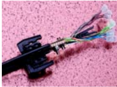
Cap, Bond Connector and Splices

After preparing the service wires, simply lay them within the grooves in the cap, lay the exposed cable shield within the bond connector and tighten. Splices on the individual pairs are easily organized around the integral insertion ram.